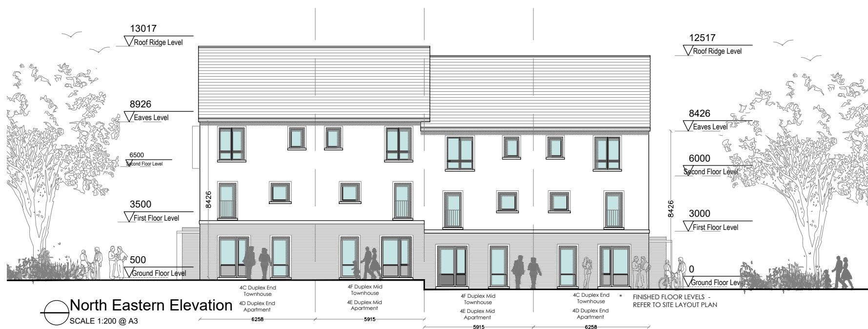
North Eastern Elevation SCALE 1:200 @ A3

FINISHED FLOOR LEVELS - REFER TO SITE LAYOUT PLAN