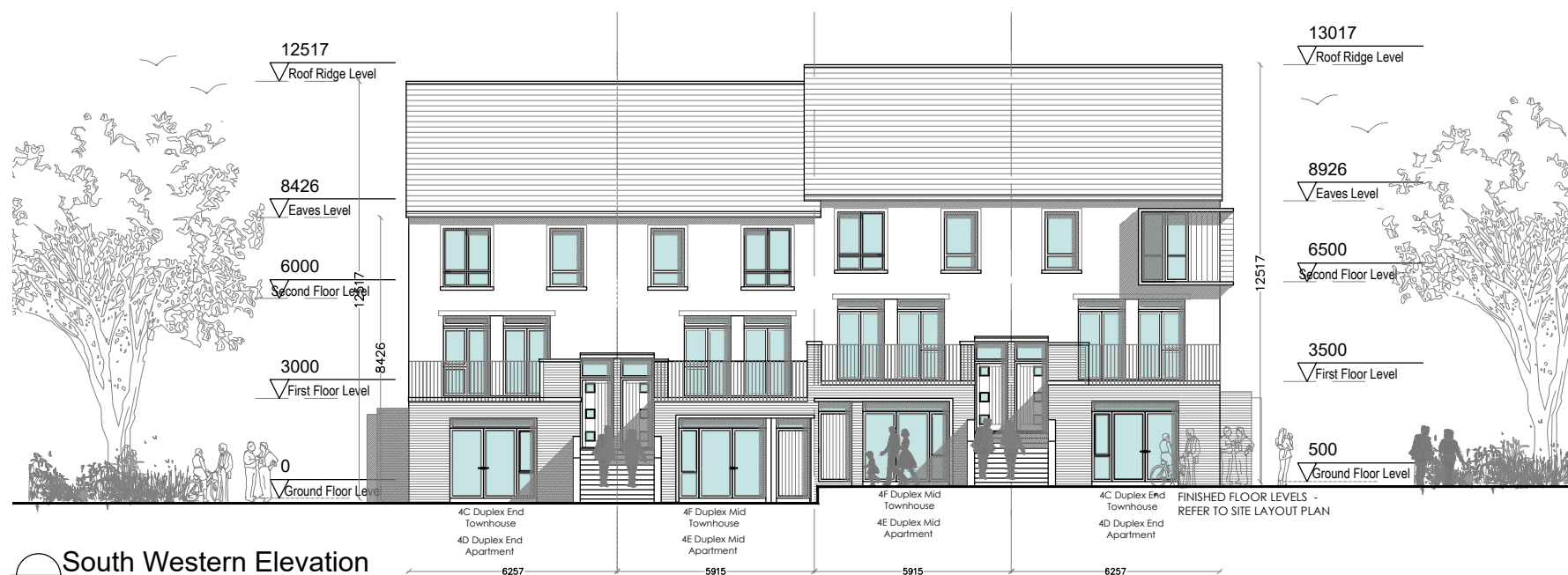
South Western Elevation SCALE 1:200 @ A3